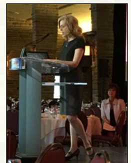
Built Green Canada at BUILD 2016.

Simply: let's keep up with the homebuyers of today and tomorrow.