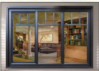
Photo of Horizon 7100 series

All Weather Windows is Canada's largest privately owned window and door manufacturer—they're also both a BUILT GREEN® Product Catalogue contributor and a BUILT GREEN® Bronze level sponsor, showing tremendous commitment to sustainable development.