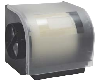
AIR-KING's WAIT 1000 Central Drum Style Furnace Mount Humidifier

With 24 products, Air-King Ventilation is our largest Product Catalogue contributor.