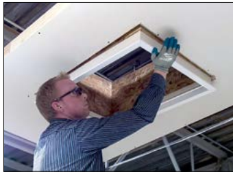
2015 Product of the Year (Durham Region Home Builders' Association): All Weather Windows Attic Hatch.